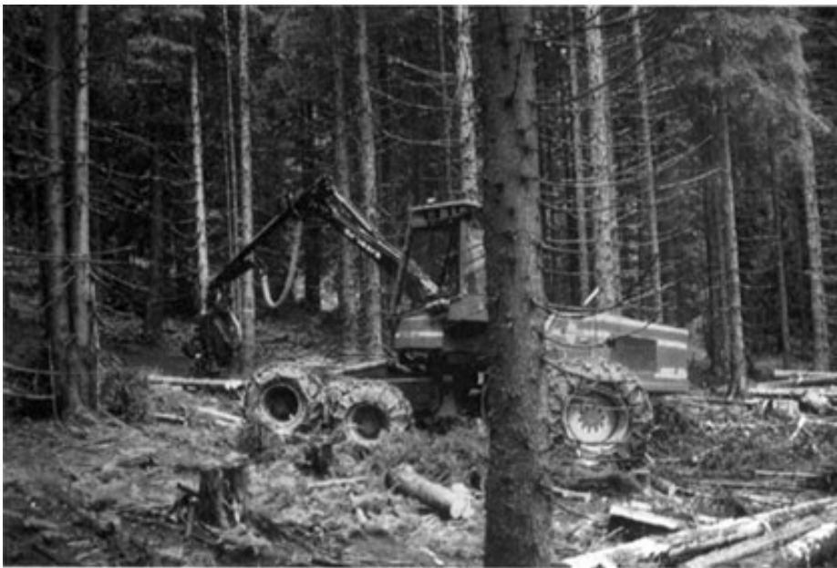
Figure 1. The Skogsjan 687 XL harvester.

The harvester was a Skogsjan 687 XL with a 601 head (Figure 1), capable of handling trees up to 55 cm in diameter. The harvester remained on the marked corridor. The Swedish operator was very experienced, having already completed three years of similar work in Austria.