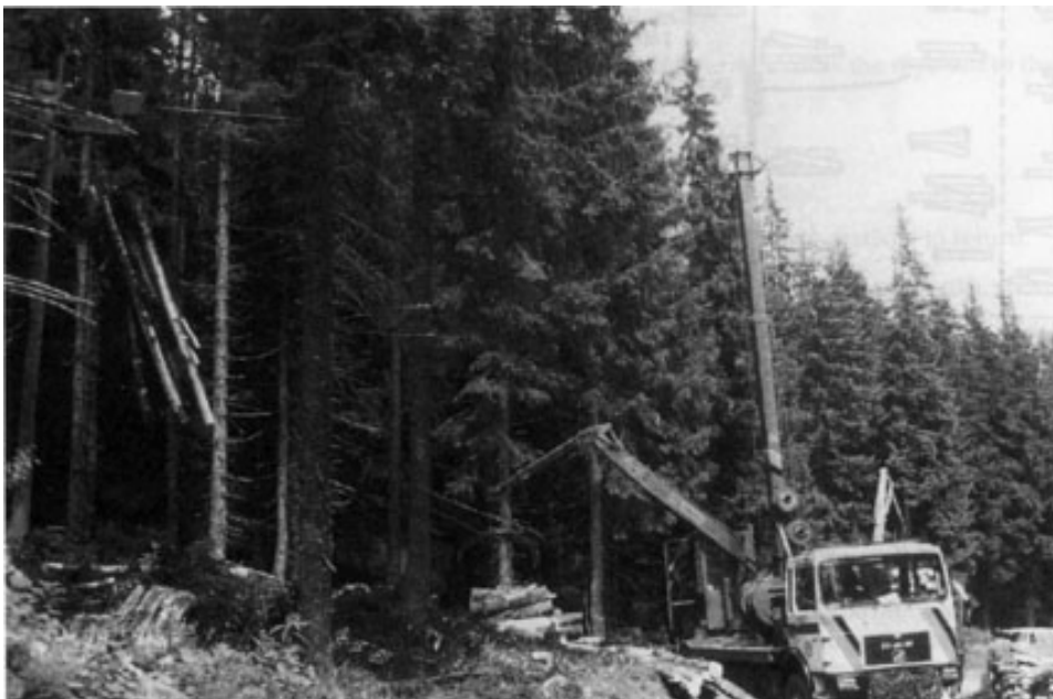
Figure 2. The Syncrofalke yarder.

Table 1 shows a summary of the corridor variations. The corridor width was set to the "typical" width of 20 meters for the harvester (a single pass) and 30 meters for motor-manual felling. In variation 2 ( C_{norm+} ) the harvester driver was to make an additional effort at creating larger bundles and improving their presentation. The third "corridor" ( C_{side} ) ran parallel and next to the first ( C_{norm} ). This timber was also extracted from the first skyline corridor to create the lateral hauling situation for variation three (Figure 3). The preparation for the fourth corridor did not vary from C_{norm} , except the extraction was carried out with just one choker-setter.